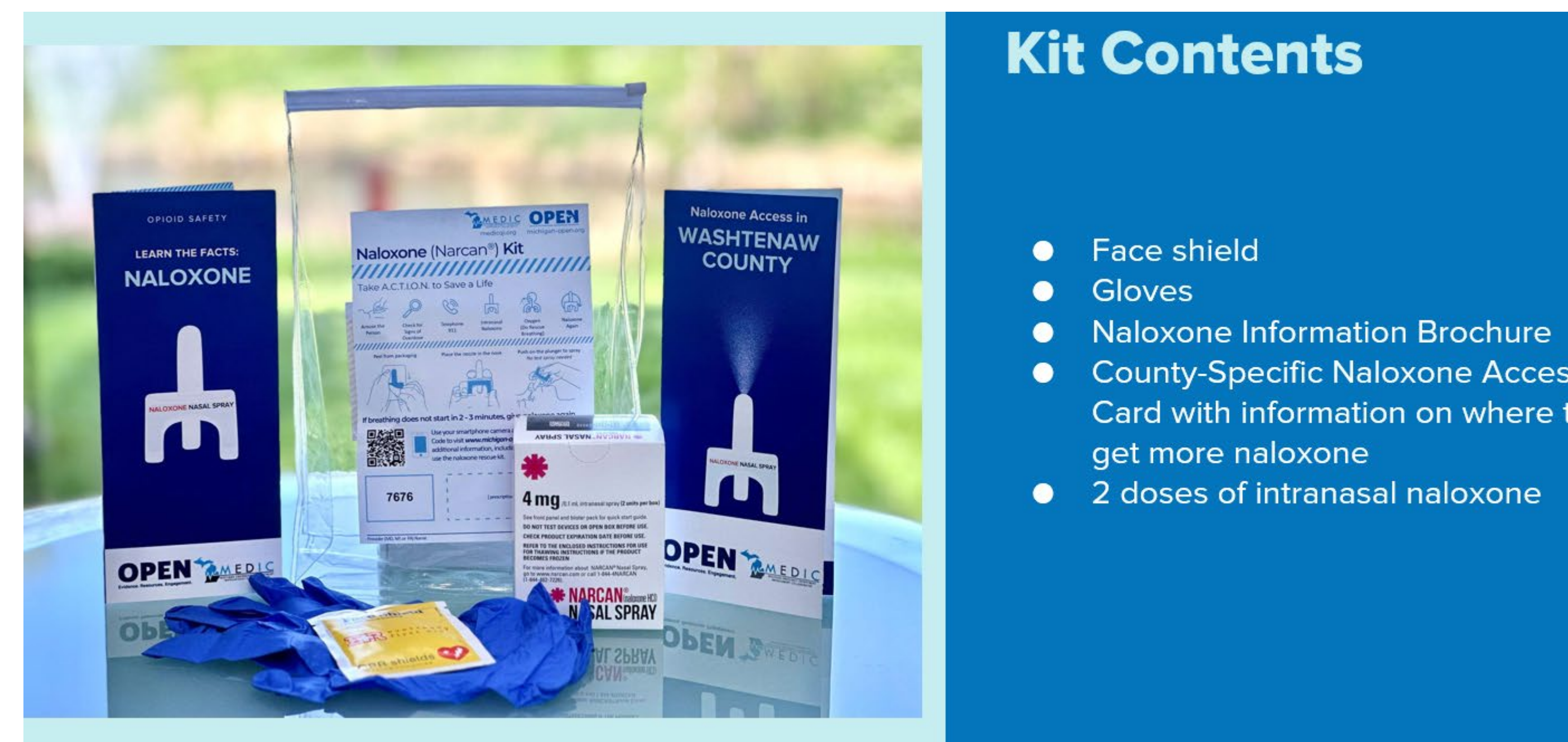
FIGURE 1: NALOXONE KIT FOR DISTRIBUTION